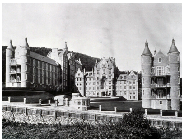
Faculty of Medicine and Health Sciences The castle on the hill

The imposing Royal Victoria Hospital, built on the southern slope of Mount Royal on land donated in 1887 by rail barons Lords Strathcona and Mount Stephen, opened its doors in 1893. The new hospital quickly became a centre for medical innovation – as well as a tourist attraction.