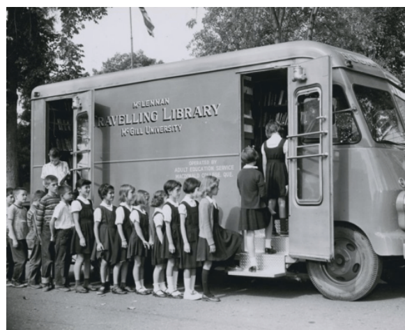
School of Continuing Studies McLennan Travelling Library

Until 1966 , the Extension Department was also responsible for the McLennan Travelling Library, which circulated 348,331 books to all areas of the province outside the Montreal urban area.